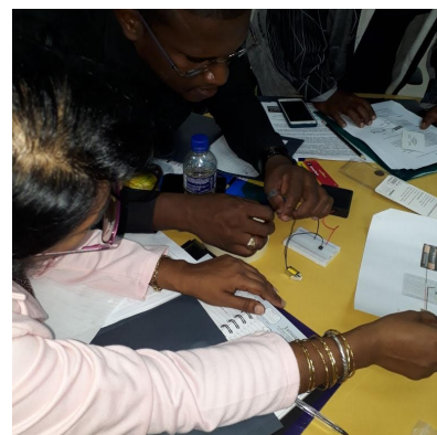
Participants getting some hands on experience

The Facilitators delivered course material on an array of topics geared towards promoting an integrated approach in the delivery of Math, Science and